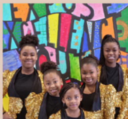
BLACK HISTORY MONTH KICK-OFF CELEBRATION! SATURDAY, FEBRUARY 4TH