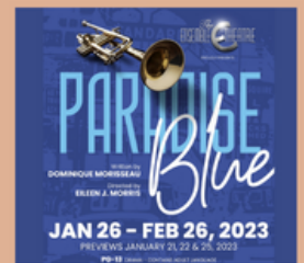
MO CITY GOES TO ENSEMBLE THEATRE SUNDAY, FEBRUARY 12TH