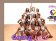
VIRTUAL SHOWCASE: BLACK HISTORY CELEBRATION OF DANCE FRIDAY, FEBRUARY 24TH