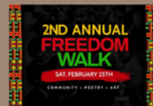
MISSOURI CITY FREEDOM WALK SATURDAY, FEBRUARY 25TH