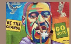
UNCOVERING THE LEGACY: A CULTURE OF MOVEMENT SATURDAY, FEBRUARY 25TH