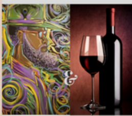
BLACK HISTORY ART & WINE EXHIBIT FRIDAY, FEBRUARY 3RD