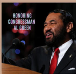
BLACK HISTORY CELEBRATION GALA SATURDAY, FEBRUARY 18TH