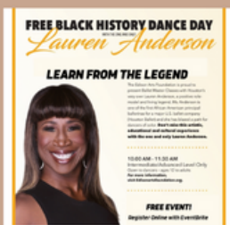
BLACK HISTORY FREE DANCE DAY SATURDAY, FEBRUARY 18TH