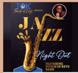
TOUCH OF KEYS & EAF CELEBRATES LOVE WITH LIVE JAZZ FRIDAY, FEBRUARY 10TH